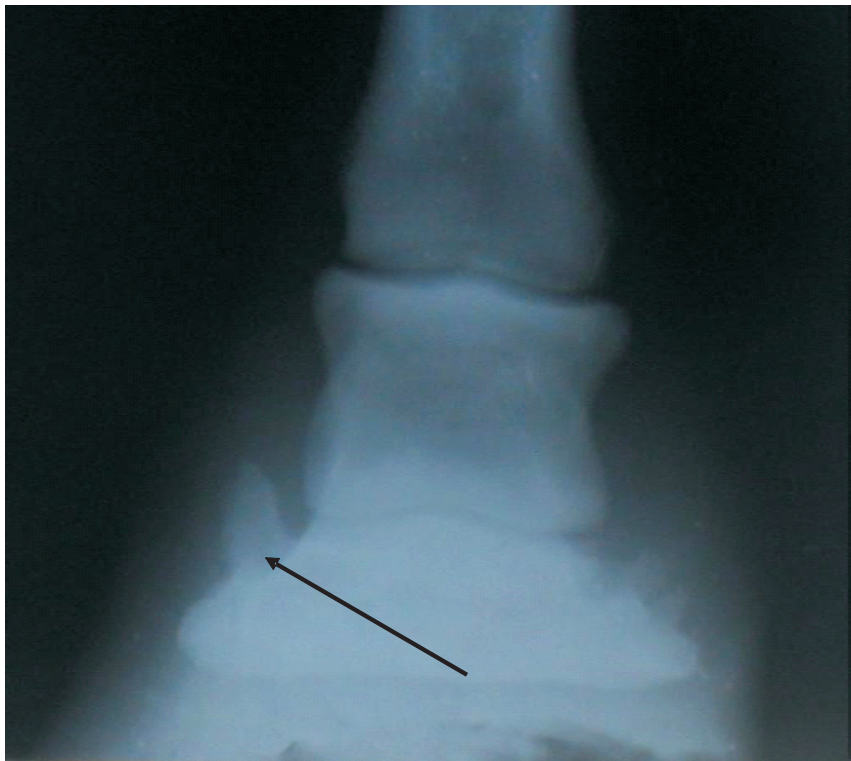
Figure 5: Ventropalmer view of the hoof showing a unilateral ossified ungular cartilages (side bone)