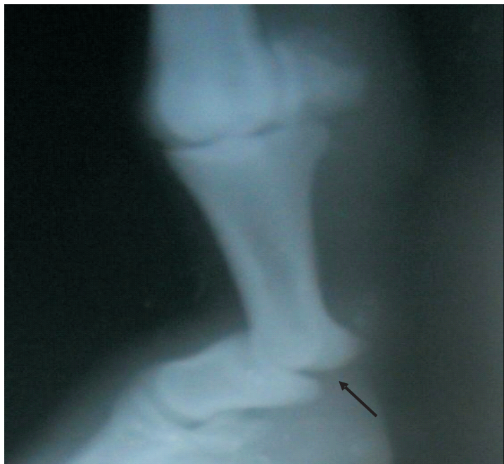
Figure 2: A lateral radiograph showing luxation of interphalangeal joints (arrow)