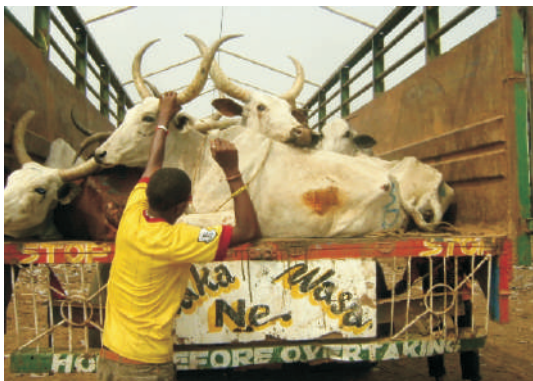
Figure 4. Off-loading of cattle at destination

journey of 36 hours. There are recent moves in developed regions, seeking to limit the duration of livestock transport to 8 hours or less. In the European Union, journey time does not exceed 8 hours (Tarrant and Grandin, 2000).