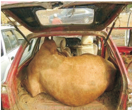
Figure 5b. Loaded cattle to be transported to the desired destination

animals arrived their destination late, stressed and weak. Animals were transported at any time of the day thereby exposing them to inclement weather and suffering. Ramp was not used for off-loading from high built trucks but were thrown down, suggesting that the animals could be battered, wounded and weakened. Animals to be loaded were folded, tied and rolled into the boots of car, which were generally unsuitably for such. It is concluded that the market cattle handlers were probably ignorant of the standards in the transportation, loading and off-loading of livestock, the paper therefore recommends training for the stakeholders.