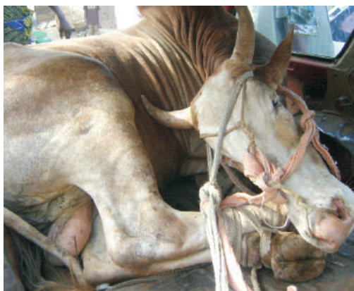
Figure 5a. Restrained cattle to be transported to the desired destination

The current study indicated that there were cattle abuse and unethical evidences in major cattle centres in Ibadan metropolis. Cattle were transported on bad roads with low speed and roofless trucks, and the