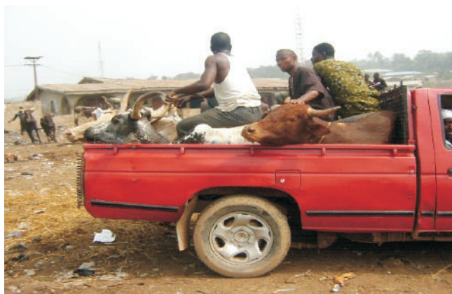
Figure 1. Showing cattle abuse during transportation out of Ibadan metropolis